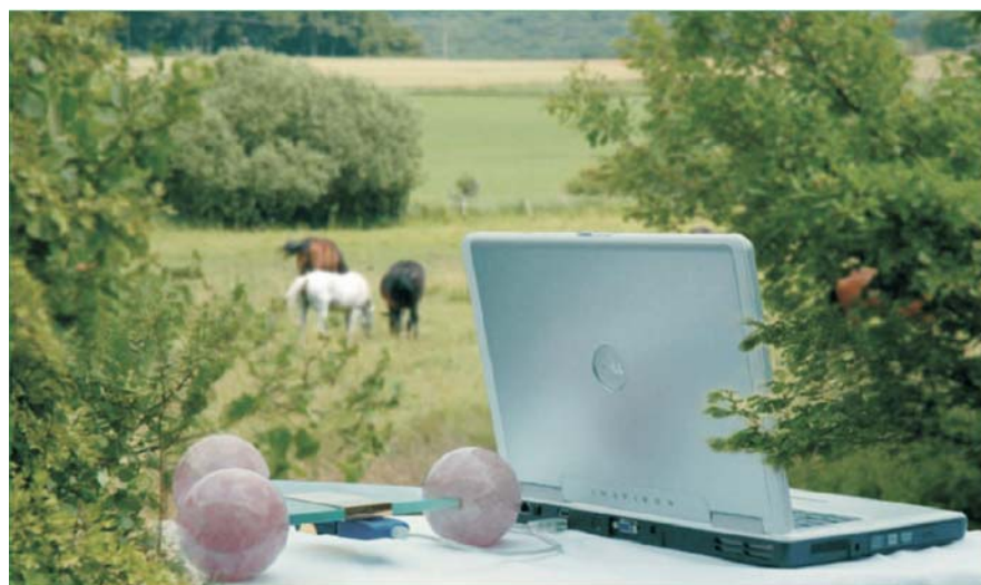
Fig. 1: Instrumental biocommunication - a particular combination of nature, medicine and technology.

As in human medicine, holistic therapy approaches are also increasingly being pursued in veterinary medicine. This is based on the awareness that comprehensive and long-term recovery is only possible if the causes of an illness or health disorder are identified and removed. But despite the sophisticated diagnosis techniques available, it is often still difficult to answer the question of why – to recognise where causes lie. With the aid of instrumental biocommunication, there evidently exists a further possibility, above and beyond the known diagnosis techniques, of gathering important patient information which covers the environment, living conditions and stresses of the patient, and thus facilitates for the therapist the important research into the cause.