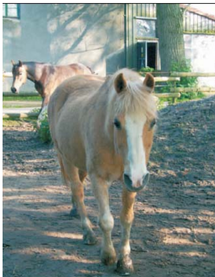
Fig. 2: Enjoying life in the paddock – thanks to instrumental biocommunication, Mona's quality of life has been significantly improved.